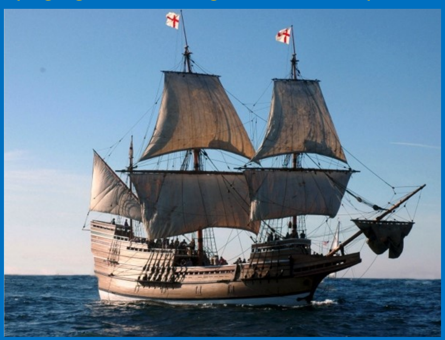
Saturday 14th—Sunday 15th March 2020 ASA License 1SW200025

Spring Regional Qualifier Long Course Level 1 & 3 Open 2020